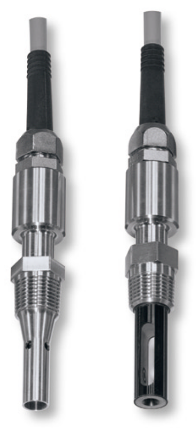
LRD 01 LRD 325

4-electrode conductivity cell with integral flow-thru chamber (7 ml volume), built-in temperature sensor; measuring range 1 \mu S/cm to 2000 mS/cm. Recommended for standard industrial applications .